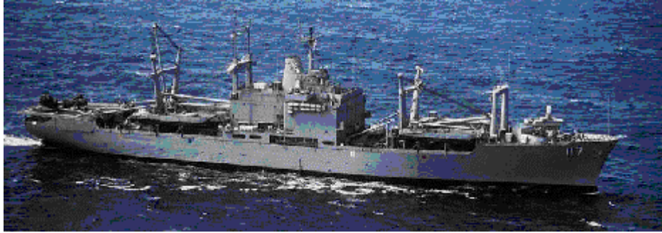
USS EL Paso (LKA-117) Pictured