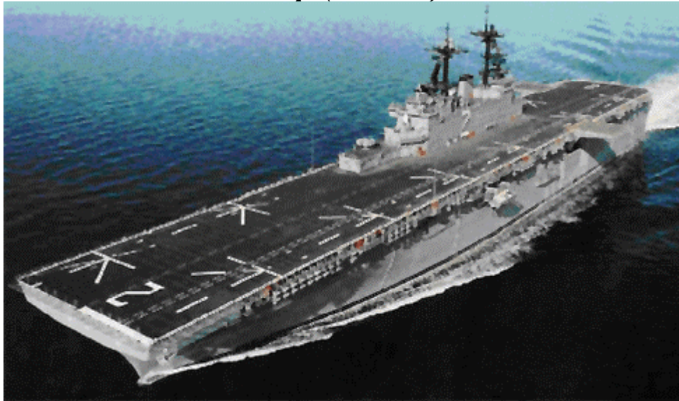
USS Essex (LHD-2) Pictured