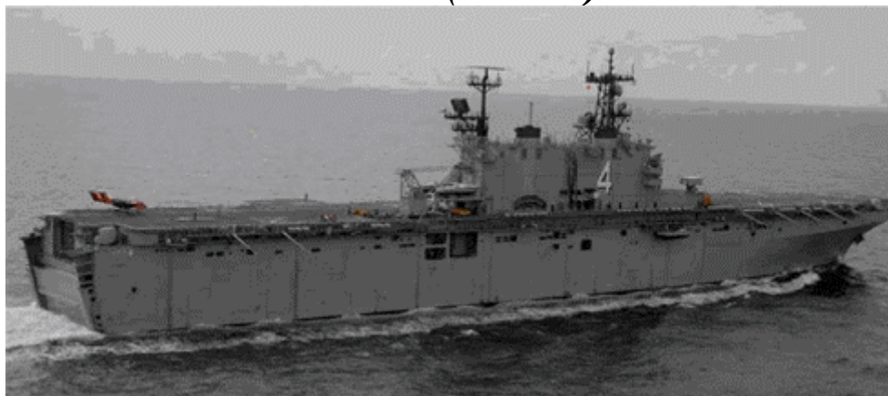
USS Nassau (LHA-4) Pictured