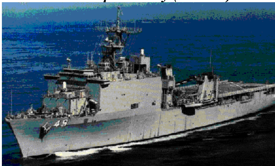
USS Harpers Ferry (LSD-49) Pictured