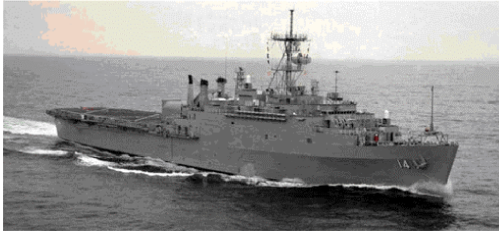
USS Trenton (LPD-14) Pictured