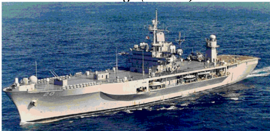
USS Mount Whitney (LCC-20) Pictured