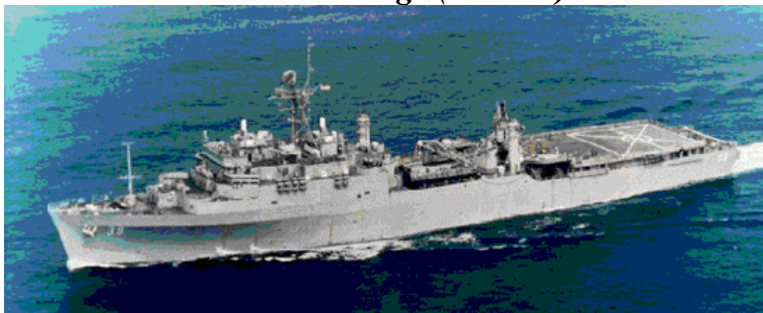
USS Mount Vernon (LSD-39) Pictured