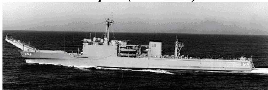
USS La Moure County (LST-1194) Pictured