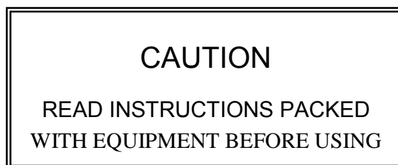
FIGURE 2. Caution plate .

5.3.6 Schematic, wiring, and cable diagram . When these are provided, they shall be in the form of labels or direct marking on a suitable surface of the item.