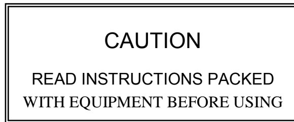
FIGURE 2. Caution plate .

5.3.6 Schematic, wiring, and cable diagram . When these are provided, they shall be in the form of labels or direct marking on a suitable surface of the item.