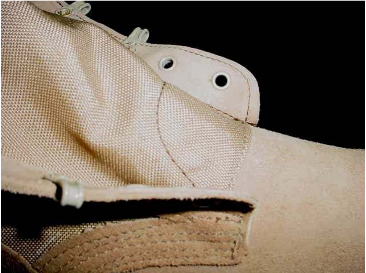
FIGURE 2B. Close up view of vamp/gusset seam (lateral view).