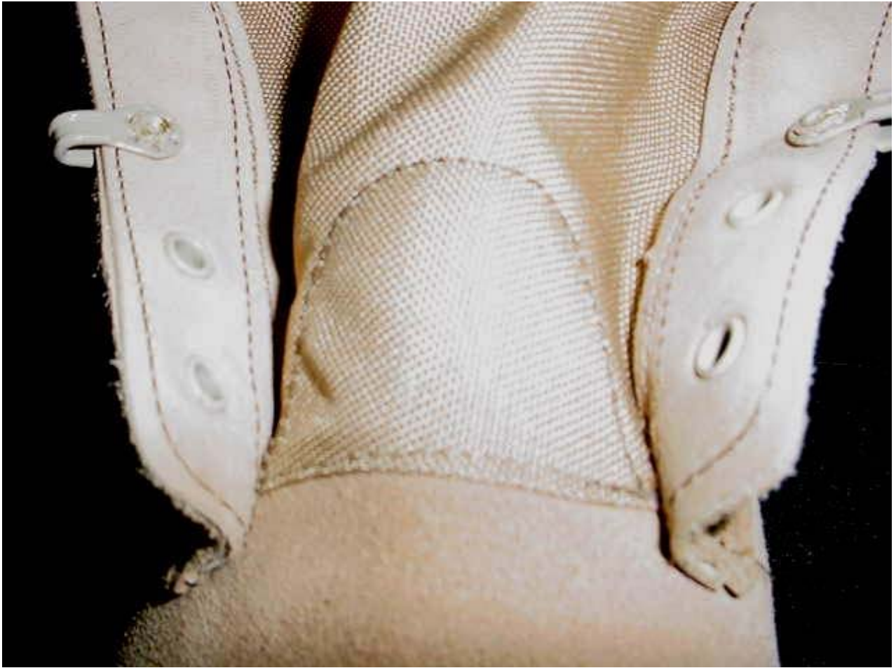
FIGURE 2A. Close up view of vamp/gusset seam (front view).