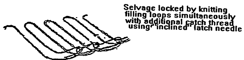
CATCH CORD DIAGRAM