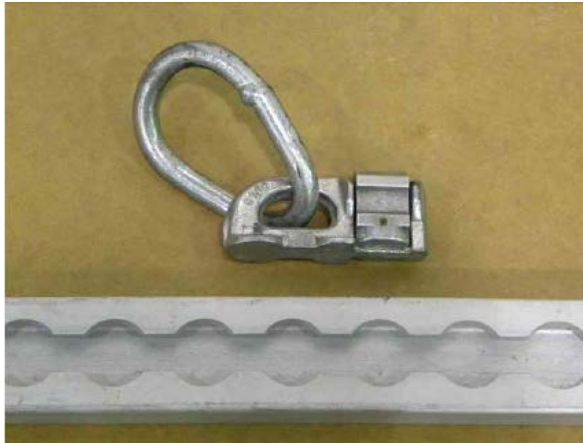
FIGURE 3. TETHER RESTRAINT USAGE