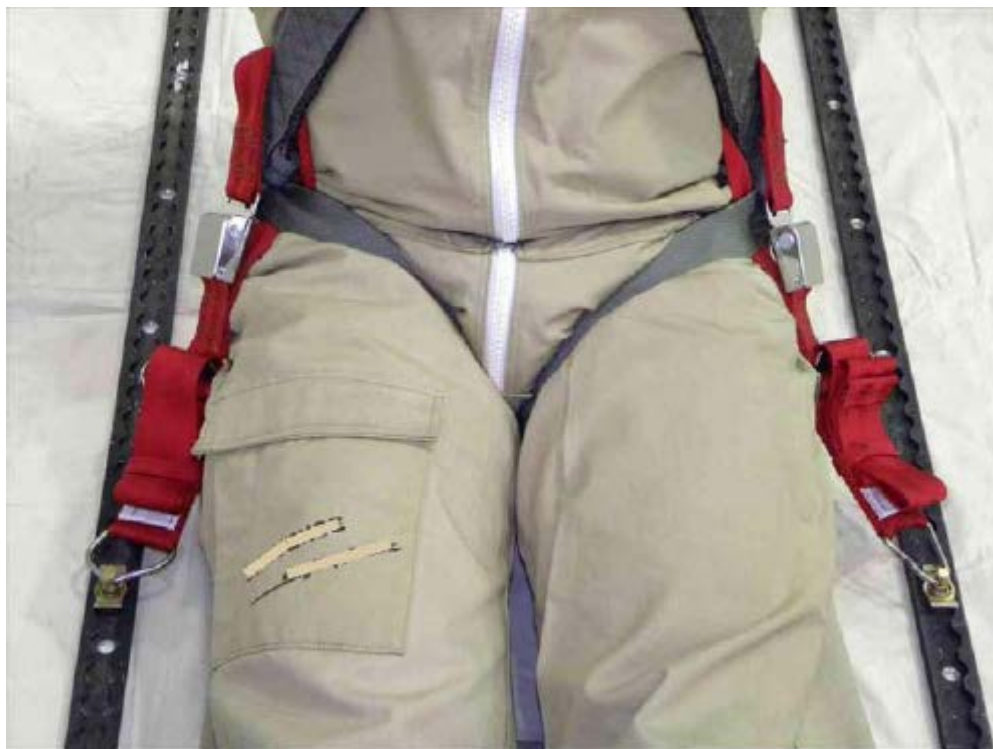
FIGURE 9. DUAL POINT, DUAL TETHER RESTRAINT ATTACHMENT TO FLOOR FOR REAR-FACING STRADDLE