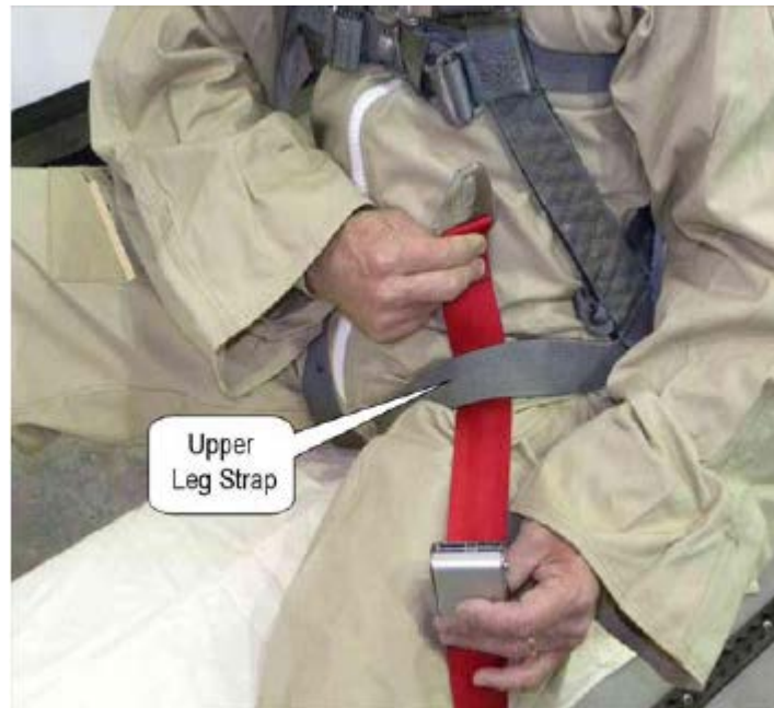
FIGURE 5. PASS TETHER LOOP UNDER MAIN LIFT WEB