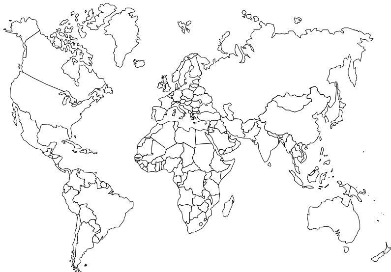
Figure 2-1 Example Figure