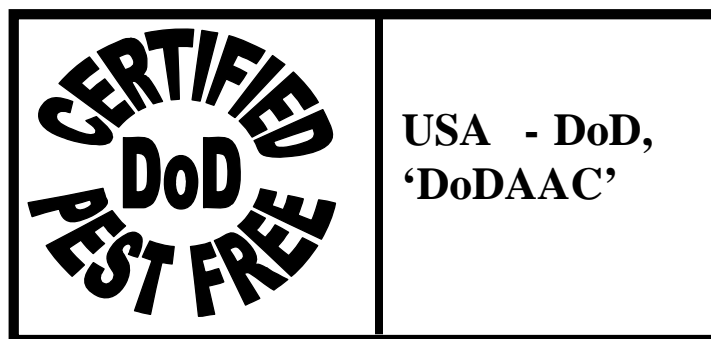
Figure AP3.F1. DoD "Pest Free" Certification Mark

DoD "Pest Free" Certification Marking. Certification and application of the DoD "Pest Free" certification marking (see Figure AP3.F1) is authorized if the material successfully passes the established moisture and visual inspection standards (see paragraph AP3.2.) and has a valid date of pack prior to December 31, 2007. The DoD "Pest Free" certification mark shall display the letters "DoD," the words "Certified Pest Free," and the DODAAC of the packaging or shipping activity. The DODAAC provides identification. (See Figure AP3.F1.)