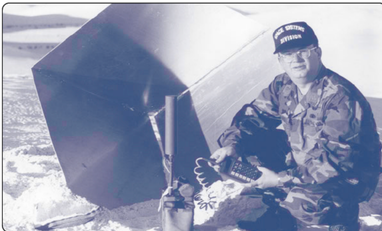
Hand-Held GPS Receiver Being Used in the Desert

The development of GPS is still in its infancy. The surface of possibilities is barely scratched. Research promises even greater benefits from increasing use of GPS. Some projects seem as amazing as an Isaac Asimov science-fiction novel, for example earthquake warning systems using high-density grids of GPS monitoring stations and GPS data com-