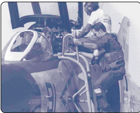
GPS is standard equipment for military aircraft

NAVSTAR GPS consists of five ground stations and a space-based constellation of 24 satellites circling the earth at an altitude of 10,988 nauti-