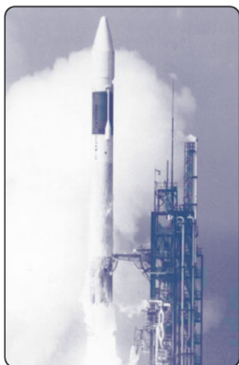
Launching a GPS Satellite

The total value of GPS is incalculable, and total dollar savings unknowable, but the potential for GPS is enormous.