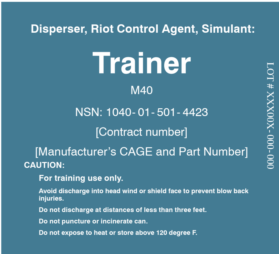
Figure 3. Marking for Type 3 disperser (Simulant)