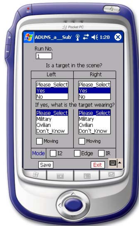
Figure D-3. PPC configured for MOL or MCS test.