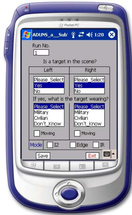
Figure D-3. PPC configured for MOL or MCS test.