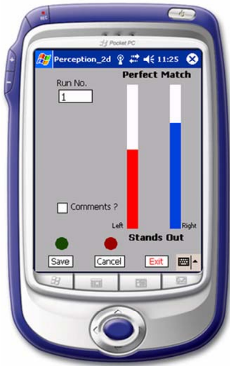
Figure D-2. PPC configured for ME test.