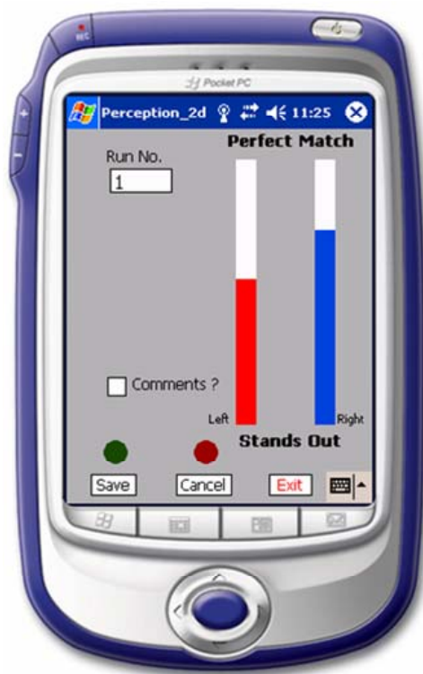
Figure D-2. PPC configured for ME test.